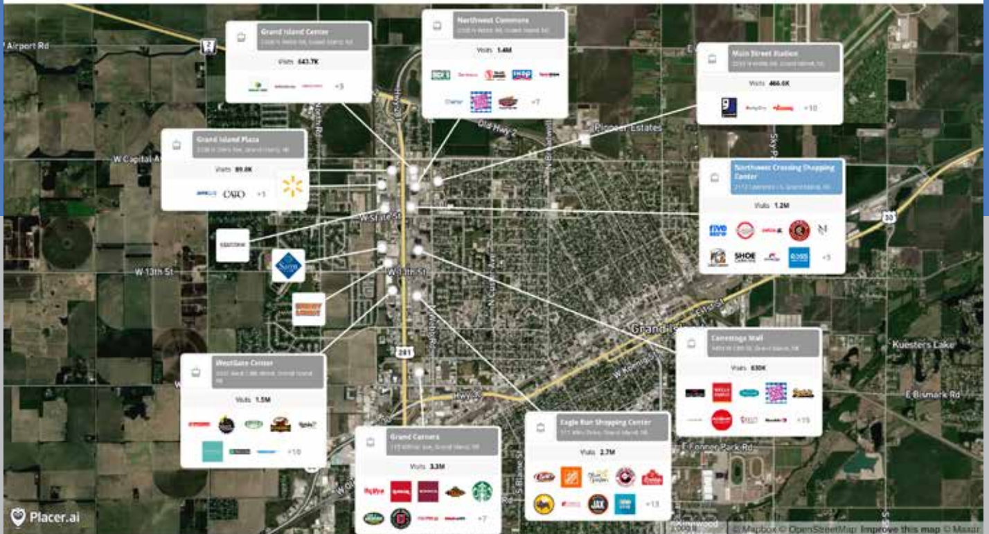
Northwest Crossing Retail Aerial