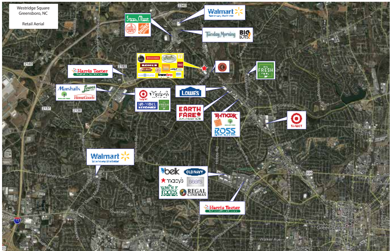
Westridge Square Greensboro, NC Retail Aerial