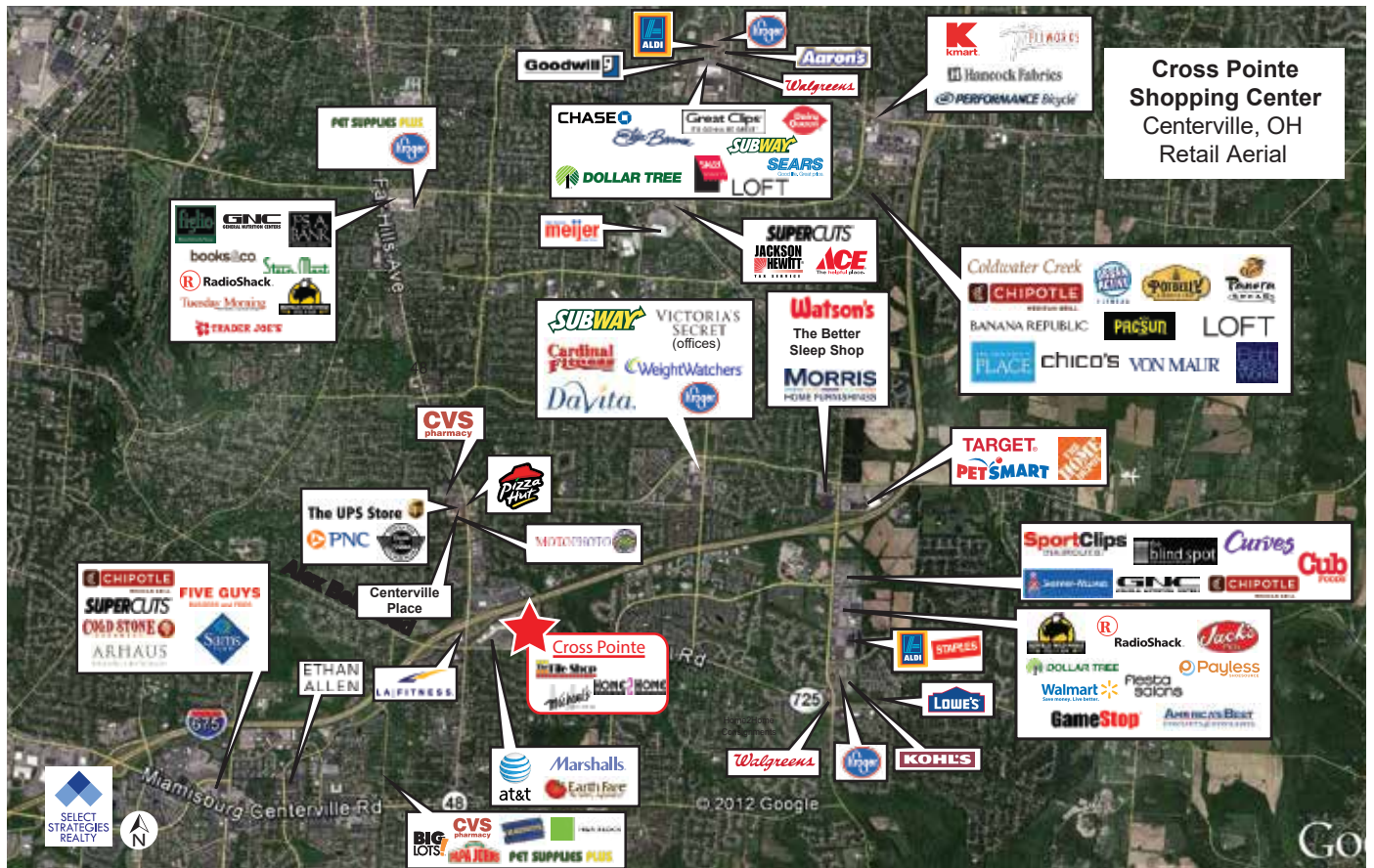
Cross Pointe Shopping Center Centerville, OH Retail Aerial